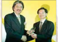
Mr. Tsang, JP, Financial Secretary of Hong Kong presenting the Award